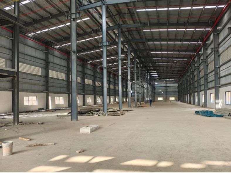
ON SITE PHOTO